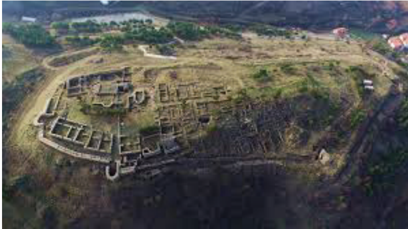
Fig. 1. Viničko Kale

The terracotta reliefs from the Viničko Kale, also known as “Vinica icons”, although discovered more than forty years ago, are still treated as one of the greatest archaeological enigmas in the area. Archaeological objects of great national and general civilization value have been exhibited in several world museum centers: Vatican, Rome, Zagreb, Moscow, Ljubljana, Belgrade, Munich, Warsaw, Ankara, Lisbon, Paris, Utrecht, Kiev. There are a large number of unanswered questions related to their functional purpose and significance, and some of the relief representations are not yet deciphered (Fig. 2).