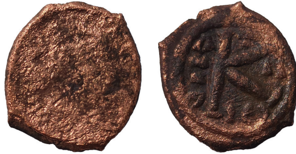
Fig. 4. Coin of Justin II (566–567)

above it, on the ground level, a bronze coin of 20 nummi by Justin II (566–567) was found. (Fig. 4) 12