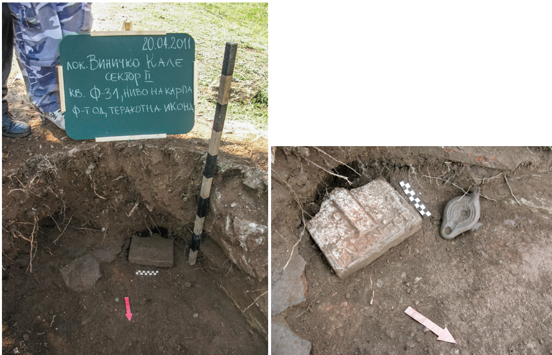
Fig. 5. The discovery of an already out of function terracotta relief together with a lamp, on the rock itself under the foundations of a building that was built in cca530 and functioned until the end of the 6th century.

During the archeological excavations in 2011, in one of the premises of the building with working name Object III, in the village and part of the fortification, under the ruin layer of the building, more precisely under the foundation of one of the walls of the building, a fragment of a terracotta relief with a representation of Constantine's cross was found 13 , together with a ceramic lamp. (Fig. 5).