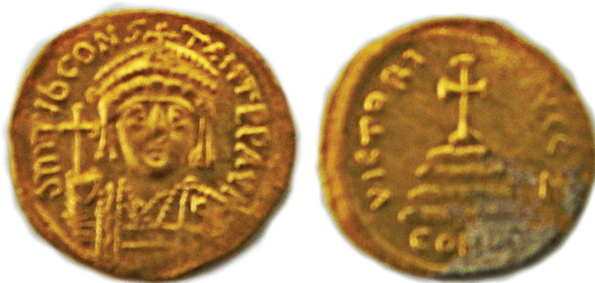
Fig. 6. Solidus of Tiberius II Constantine (578–582)

reign of Justinian I, and its demolition at the very end of the 6th century, certainly after the reign of Tiberius II Constantine (578–582), ie we date the building to the second construction phase of the late antiquity on Vinica Fortress.