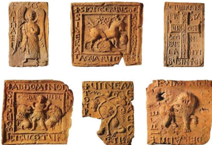
Fig. 2. Vinica terracotta reliefs

The terracotta reliefs from the Viničko Kale, also known as “Vinica icons”, although discovered more than forty years ago, are still treated as one of the greatest archaeological enigmas in the area. Archaeological objects of great national and general civilization value have been exhibited in several world museum centers: Vatican, Rome, Zagreb, Moscow, Ljubljana, Belgrade, Munich, Warsaw, Ankara, Lisbon, Paris, Utrecht, Kiev. There are a large number of unanswered questions related to their functional purpose and significance, and some of the relief representations are not yet deciphered (Fig. 2).